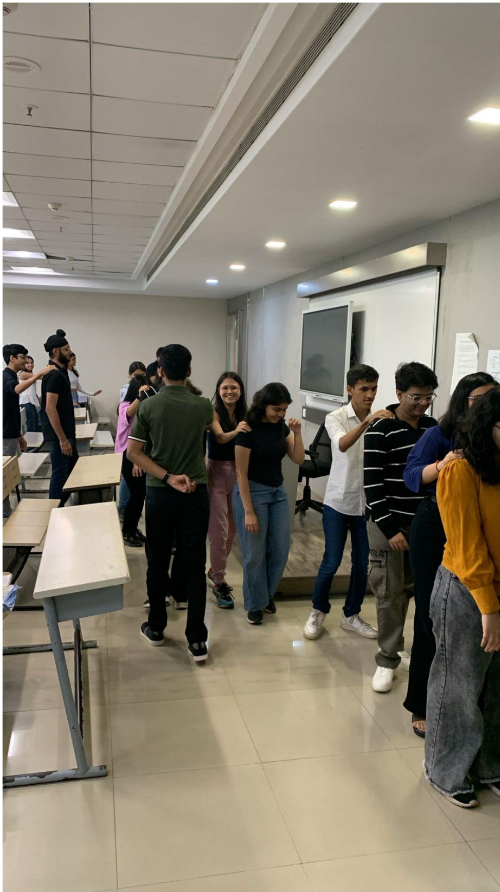
Trust-building activity during team-building training