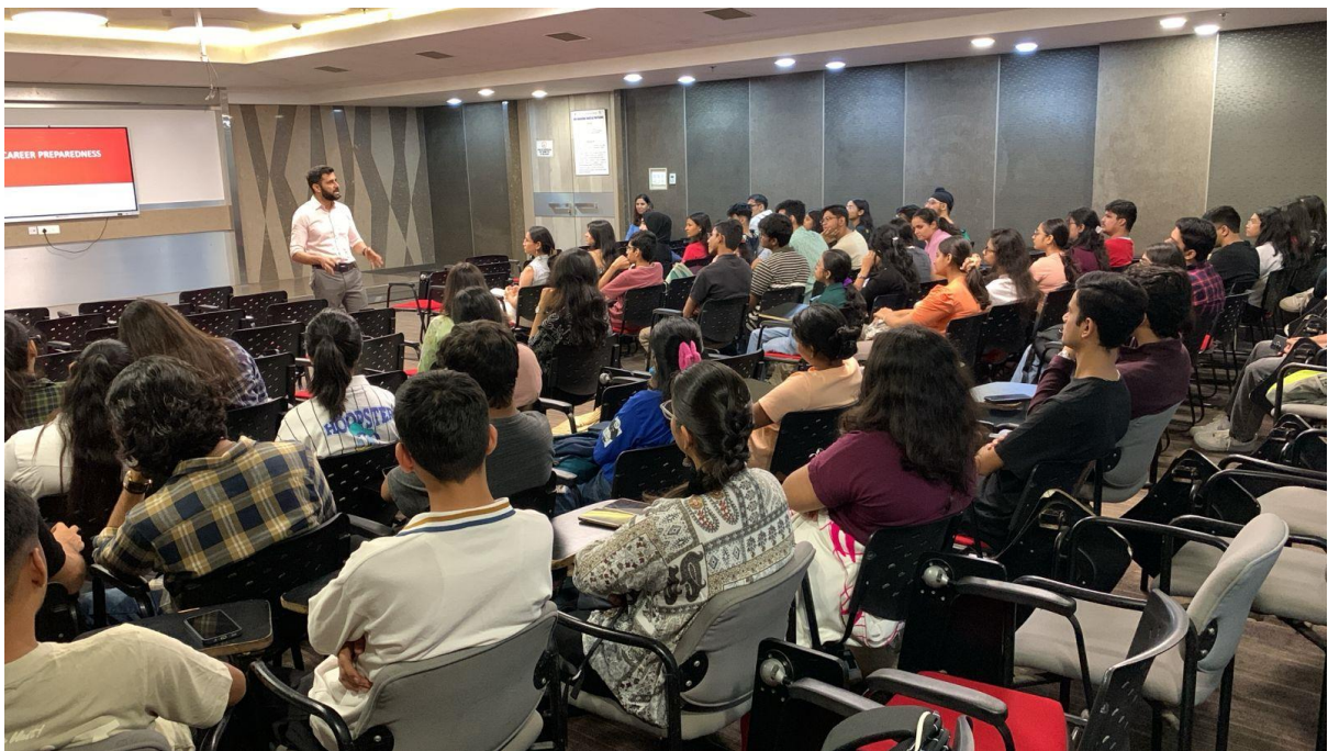
Talk on Career Preparedness