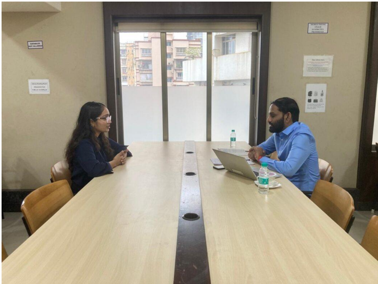
Campus placement interview